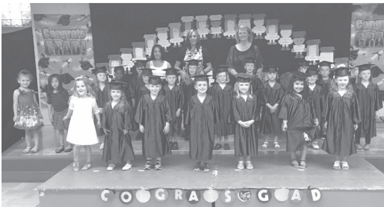
PRESCHOOL GRADUATION 2016

St. James the Apostle Catholic Church at 5804 Sheridan Rd in Kenosha welcomes everyone to The Kenosha Civic Veterans Parade, on Sunday July 3 rd . St. James will again be selling Hotdogs, Brats, Chips, Soda and Water, prior to and after the Parade in our parking lot, one block north of the Parade Route on Sheridan Rd. All proceeds will be used towards helping to defray the costs of recent structural repairs to the historic Church.